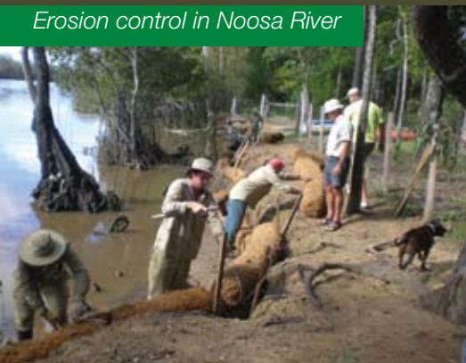
Erosion control in Noosa River